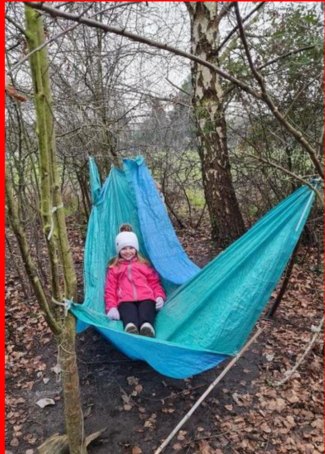
"A nurturing school, full of wonderful opportunities"-parent

We are lucky enough to have a large school site with plenty of playing fields, our very own forest school area and swimming pool. Each week we enjoy outdoor learning in forest school and using our vast grounds for exploration.