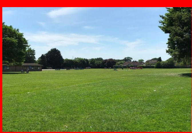
"An amazing school that supports every single child to reach their fullest potential."-parent

We are lucky enough to have a large school site with plenty of playing fields, our very own forest school area and swimming pool. Each week we enjoy outdoor learning in forest school and using our vast grounds for exploration.